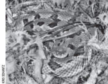
To rattlesnakes, we're the predators

fear, others may stand near the snake to take pictures, and some may move away to avoid any further contact. Those who kill the snakes are not only committing a crime, but also a senseless act of cruelty. Those taking pictures and watching a snake, although doing so with good intentions, are causing the snake stress and anxiety, and, more than likely, forcing the snake to take a defensive posture. To the snake, we are the predators.